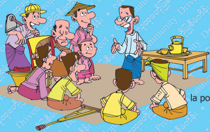
Ataang (12) - Bibi raanna a pekthli akiina (Akiina nawh atah dymm sakna/ tong sakna)