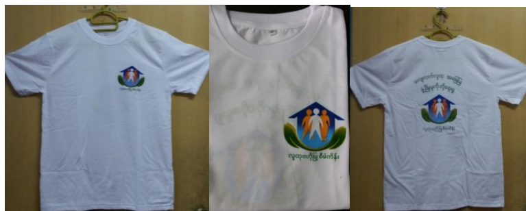
Front – front logo details – back and text and logo details

The candidate bidders can obtain a sample T-Shirt from the Department of Rural Development on simple request, but are kindly asked to come collect the sample T-Shirt after having made an appointment with the Procurement Officer in charge of this ITQ.