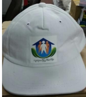
CAP – front view

The candidate bidders can obtain a sample Cap from the Department of Rural Development on simple request, but are kindly asked to come collect the sample Cap after having made an appointment with the Procurement Officer in charge of this ITQ.